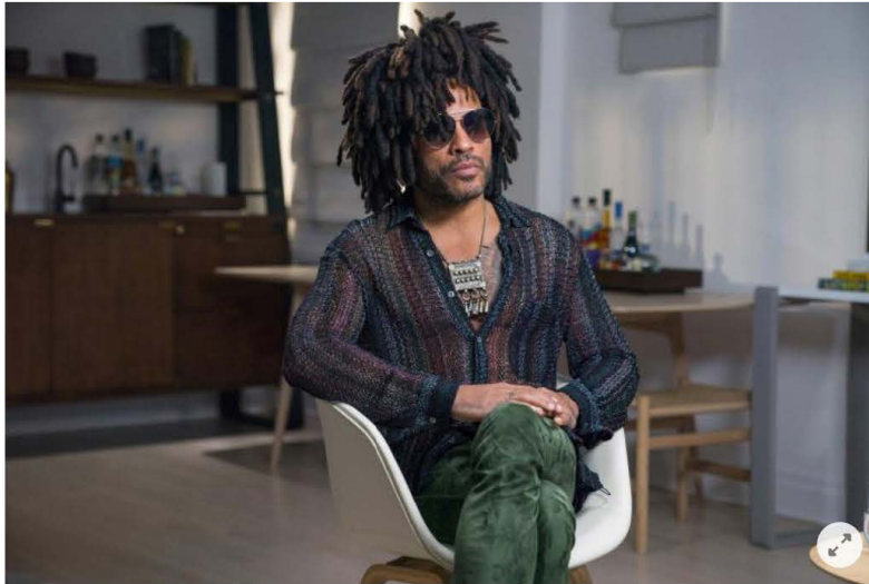
The boss himself. His company has eight employees.

Kravitz has been oscillating between micro and material samples since 2003 - the year in which the American, who lives in Paris, founded his own design company. "Kravitz Design" designed products ranging from wallpaper (for Flavor Paper) to door handles (for Rocky Mountain Hardware) to chairs (for Kartell) and chandeliers (for Swarovski). In between, he furnished individual apartments, suites for the four-star hotel "SLS South Beach" and finally a super luxury villa in the hills of L.A. "Kenmare 75" in the Nolita quarter in Manhattan is the first multi-family property and, with 38 apartments plus lobby, gym and roof terrace, the superstar's largest project to date.