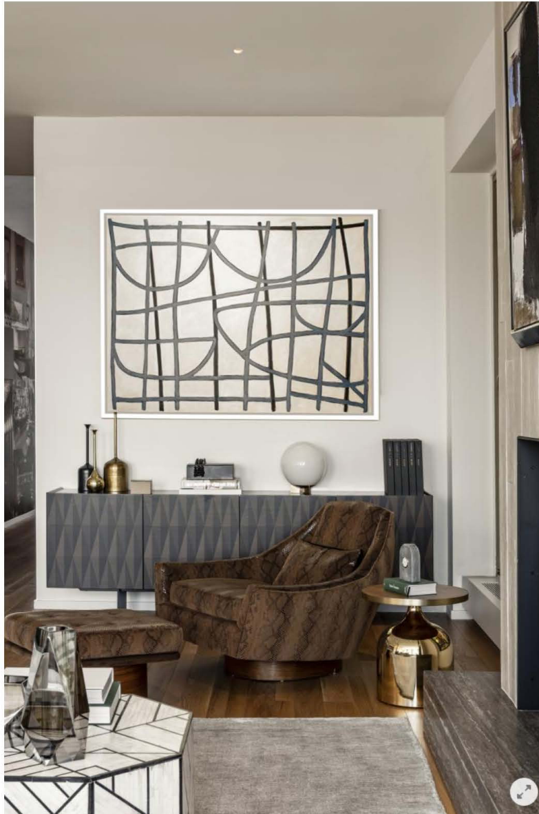
Cool and cozy: Chill in a snakeskin chair close to the fireplace. The gold-colored side table is also designed by Kravitz.

It is a mix of glamour, sexyness and urban mundanity. A rock star has furnished the apartment house "Kenmare 75" in New York: Lenny Kravitz. He extravagantly combines different styles in his interiors. "Music and design are very similar," says Kravitz. "They are both sculptural and layered. You start with a base and then you build on it. At the end you have a mood, a vibe. Something that makes you feel different than before," he explains.