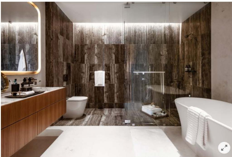
Room for vanity: In the shower is room for two if the tub is occupied.

Kravitz has been oscillating between micro and material samples since 2003 - the year in which the American, who lives in Paris, founded his own design company. "Kravitz Design" designed products ranging from wallpaper (for Flavor Paper) to door handles (for Rocky Mountain Hardware) to chairs (for Kartell) and chandeliers (for Swarovski). In between, he furnished individual apartments, suites for the four-star hotel "SLS South Beach" and finally a super luxury villa in the hills of L.A. "Kenmare 75" in the Nolita quarter in Manhattan is the first multi-family property and, with 38 apartments plus lobby, gym and roof terrace, the superstar's largest project to date.