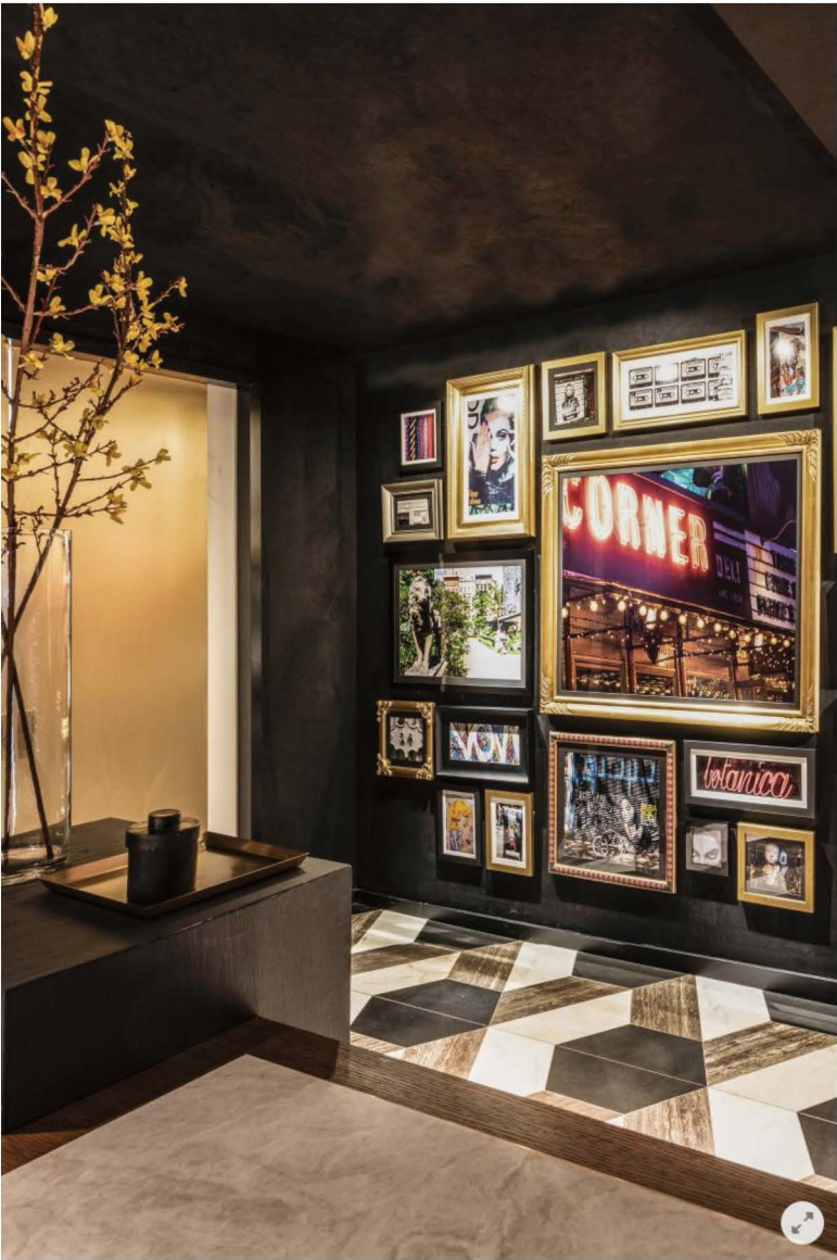
The entrance to the elevator: Three different natural stones were laid to a graphic pattern. Of course, a concierge watches 24 hours a day.

Golden elevator doors, a snakeskin armchair: Lenny Kravitz, the musician, establishes himself as an interior designer. In New York he has furnished several apartments - which have hefty prices for a few square meters.