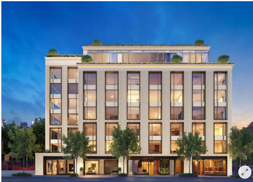
With its façade of vertical panels, the front pays tribute to New York's Grandezza.