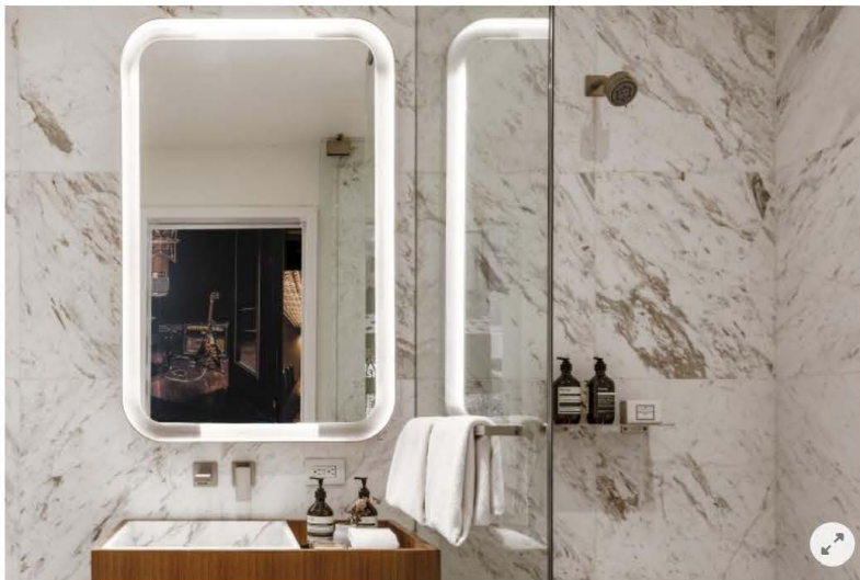
Room for vanity: In the shower is room for two if the tub is occupied.

For Kravitz, it's a home game: Just a block away, on Broome Street, the New Yorker moved into his first loft in 1988. His design company also has its offices in the neighborhood. "Nolita is one of those special places in Manhattan where the old mixes with the new and where you can be just as comfortable out and about during the day as at night.