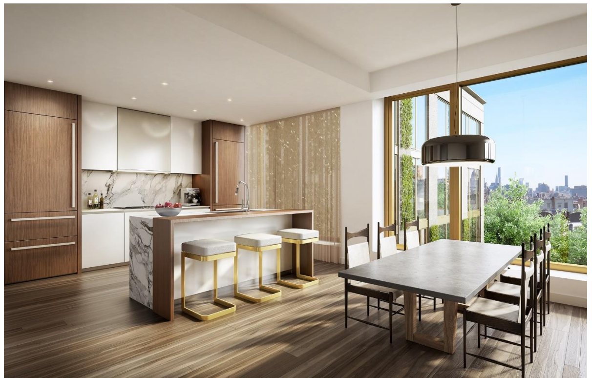
Matte-white lacquer cabinetry defines each unit's kitchen.

marks Kravitz Design's first full interior design commission.