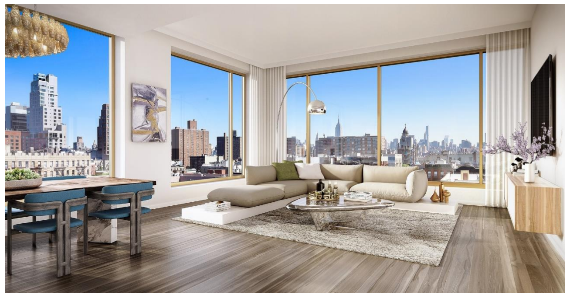
Corner units provide views of the cultural crossroads of SoHo, NoHo, the Lower East Side, Little Italy, and Chinatown.

A rich materials palette, ranging from textured metal and natural stone to warm oak, pervades the building's 38 units. Kitchens feature custom, matte-white lacquer cabinetry with integrated Gaggenau appliances. In the bathrooms, Titanium Travertine and French Vanilla marble offer a sensory experience.