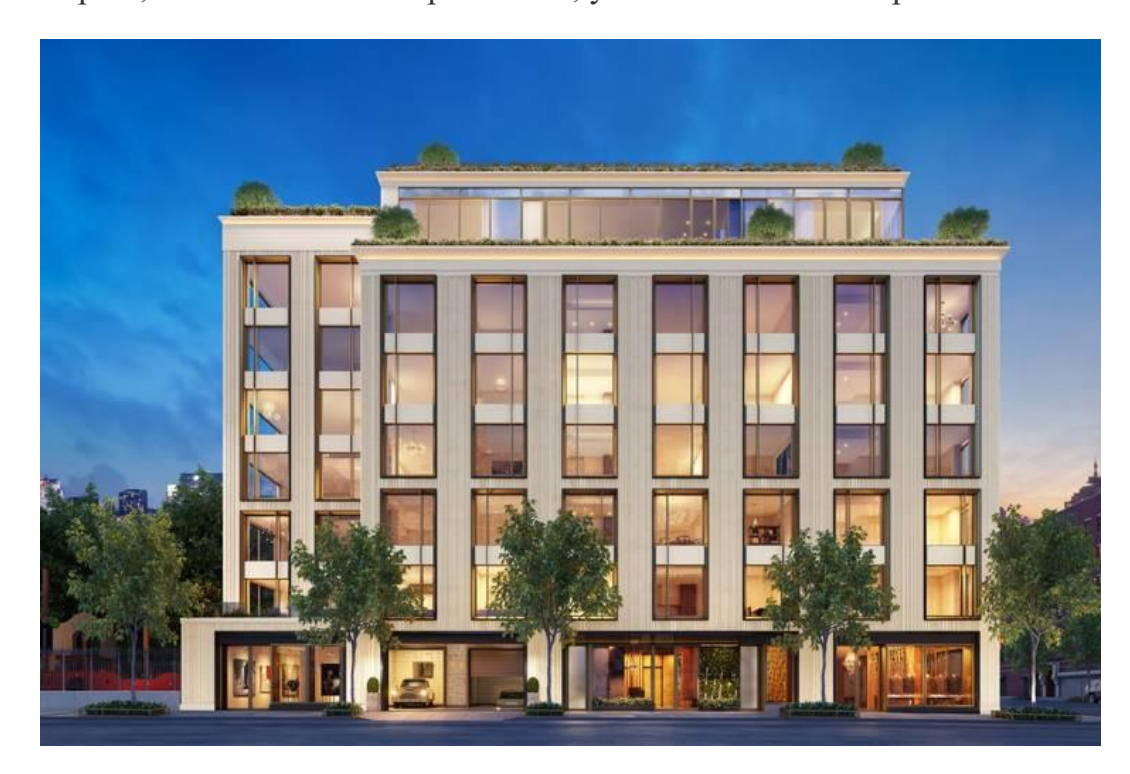
A rendering of 75 Kenmare, a 38-unit boutique condominium in New York's Nolita district slated to open next year.