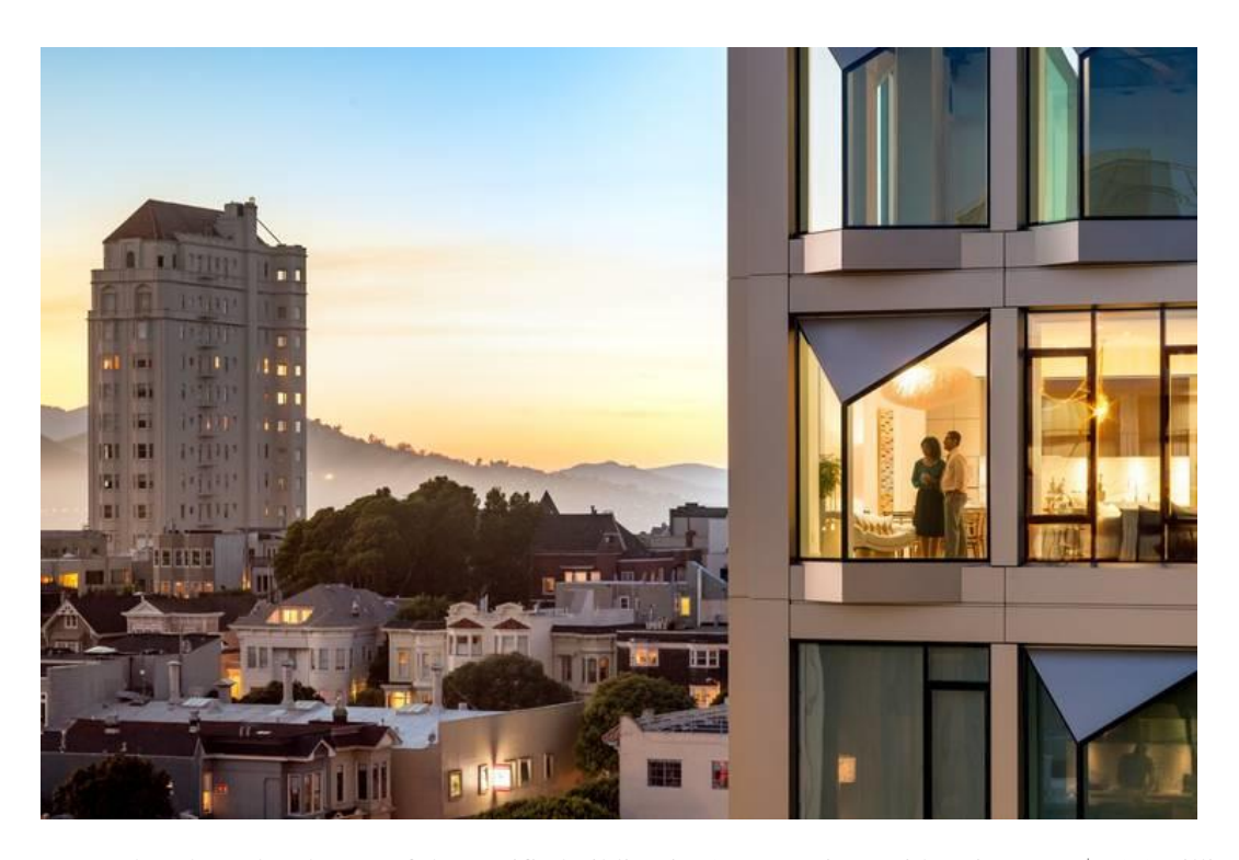
Trumark Urban, developers of the Pacific building in San Francisco with units up to $15.5 million, formed a broker advisory board of top-selling agents.